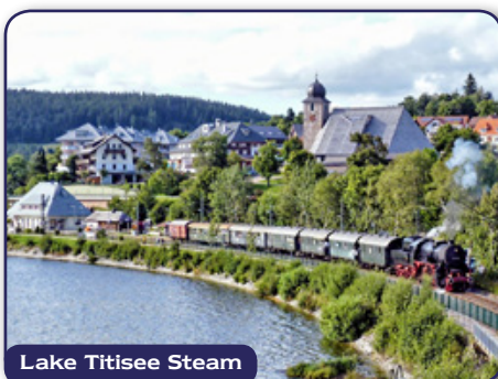
Lake Titisee Steam

Today we have the first of our mainline Black Forest steam train journeys , our train steams through the heart of the Black Forest on the scenic Schwarzwaldbahn route, famed for its stunning scenery. We travel from Triberg to St Georgen and onto Hausach . Here we have free time for sightseeing, before retracing our tracks to Triberg. (B,D)