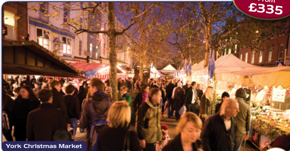
York Christmas Market