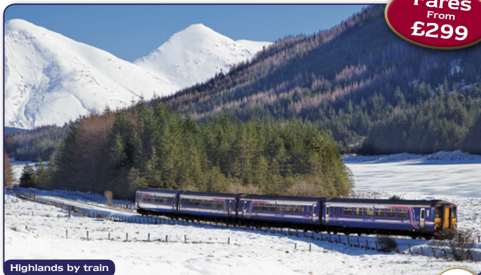
Highlands by train

Experience the glorious Highlands on a "Great Railway Journey of the World" to Kyle of Lochalsh, as deer herd in frosted glens betwixt snow topped mountains. Explore Loch Ness and its folklore.