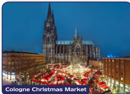
Cologne Christmas Market

Travelling southwards along the Rhine to Koblenz, the town at the river's confluence with the Moselle, we switch to the river's right bank. At Linz-am-Rhein we enjoy another quaint little Christmas Market , set within the half-timbered buildings of the Old Town, offering a timeless atmosphere and the wonderful aromas of Germany during Advent. From Linz we join the heritage