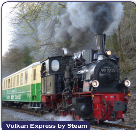
Vulkan Express by Steam

Today we travel to Cologne by train to visit its Christmas Markets . In the weeks before Christmas Cologne's squares are transformed into a sea of festive colour. From the station it is a short walk to Cologne's Gothic masterpiece cathedral, which overlooks the Christmas Market at the Dom , the largest Christmas tree in the Rhineland and over 100 stalls selling wooden toys, hearty food, warming drinks and a myriad of Christmas decorations. A short walk further is the Christmas Market at the Alter Markt in the Old Town amidst pretty squares and Cologne's famous brewery taverns. If you would like to venture further afield, a local road train connects you to Cologne's other markets, including the 'Market of Angels' at Neumarkt and the Rudolphplatz Christmas Market at Hahnenort , one of the old city gates. On the