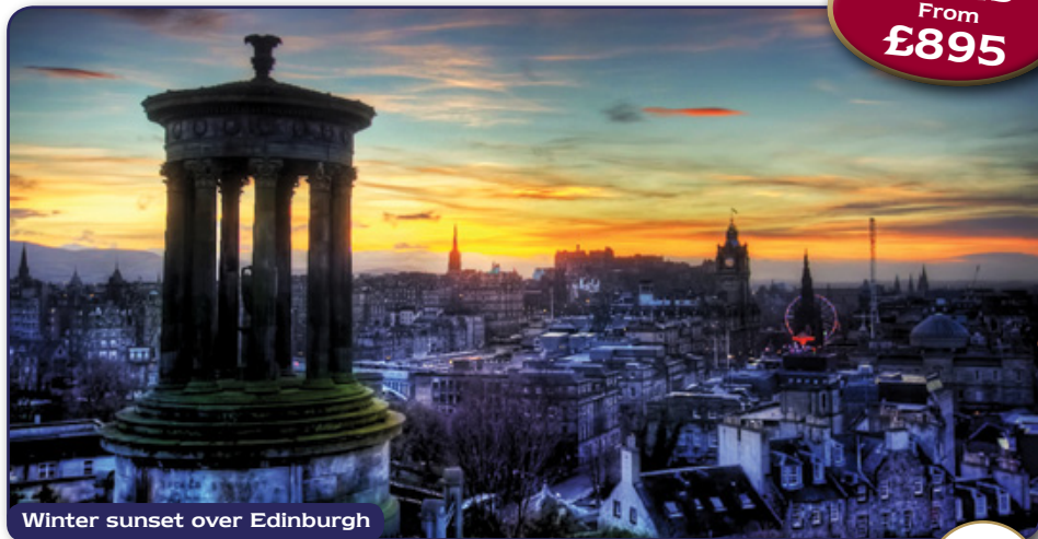
Winter sunset over Edinburgh

The West Highland Line, the Kyle Line & the Cairngorms Line – experience a truly magical pre-Christmas rail tour of the Scottish Highlands in all their wintry glory, followed by a relaxing and homely Christmas in Stirling with all the trimmings and an excursion to Edinburgh.