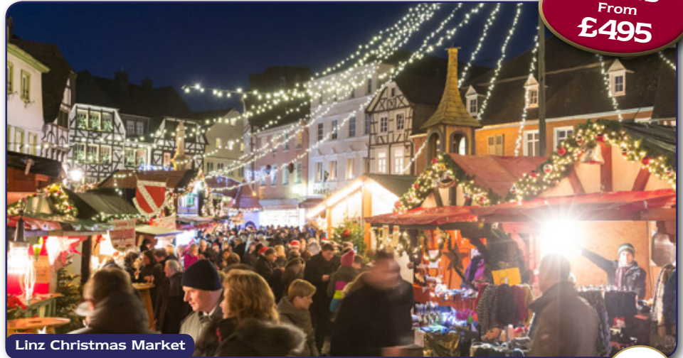
Linz Christmas Market

Hot chestnuts, almonds, glühwein – Germany's Christmas Markets are a taste sensation. Explore Cologne's varied markets, the quaint smaller markets of Linz and Ahrweiler, and explore the Rhine Valley by rail, including the Vulkan Express by steam!