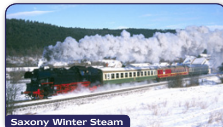
Saxony Winter Steam

A short stroll from the station, located in the heart of the city near to the historic Old Town, the Ibis hotels are inviting and modern, with comfortable bedrooms, air-conditioning, WiFi access, satellite TV and en-suite bathrooms with shower and hair dryer.