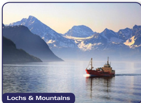
Lochs & Mountains

After breakfast it is time to bid farewell to the Highlands and return by train southwards, past the Cairngorm Mountains and down through the Lowlands to Edinburgh and homeward stations. (B)