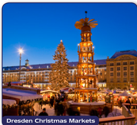
Dresden Christmas Markets

We begin with a guided tour of Dresden Transport Museum , plus the atmospheric steam loco depot at Dresden Altstadt. This is followed by a return steam ride on the second of our fantastic Saxony narrow gauge lines , up the picturesque Weisser valley currently some 15 kms to Dippoldiswalde but the new extension to Kipsdorf is due to open in time for our visit.