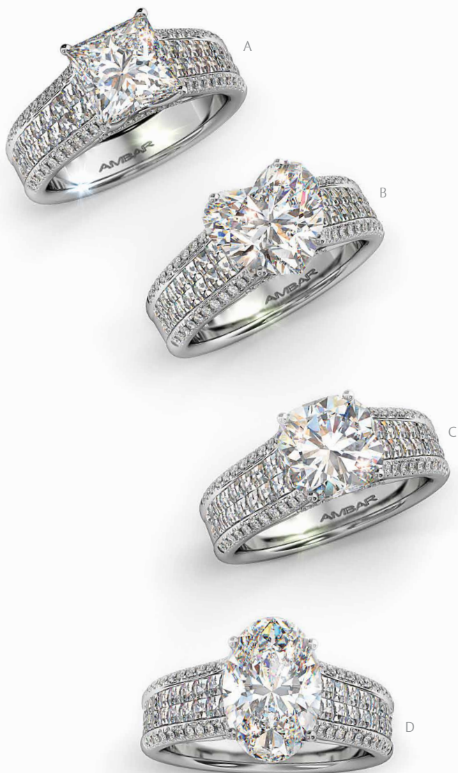
Anne ring for a (A) princess center, (B) heart center, (C) round center, (D) oval center.