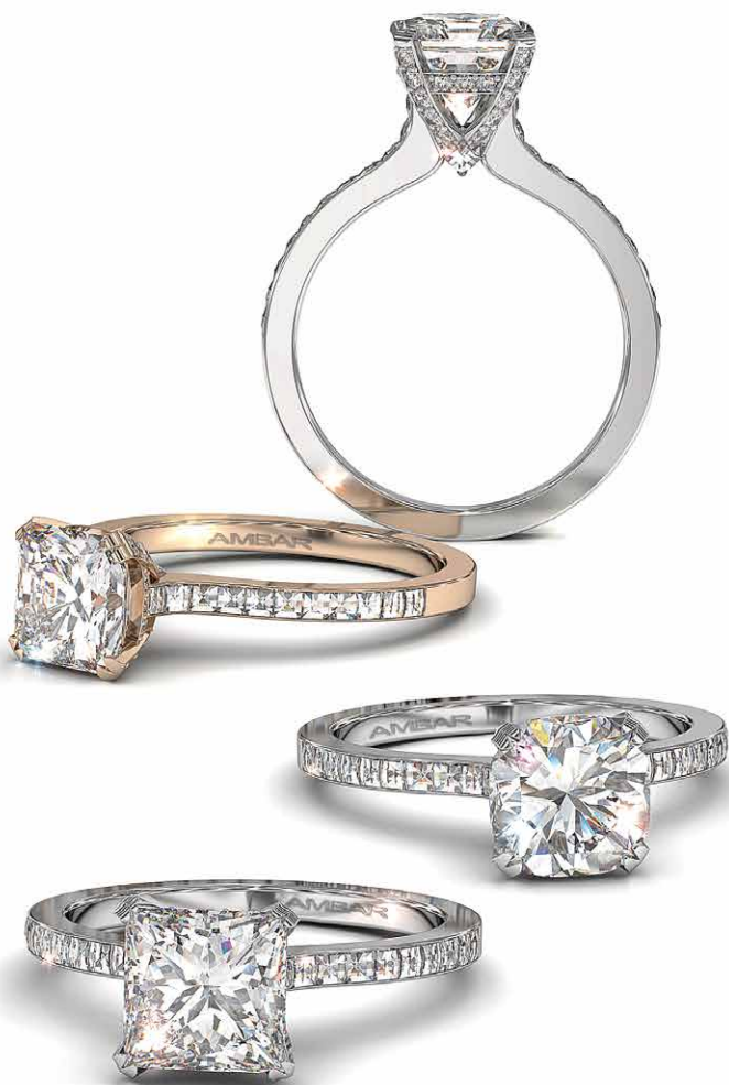
Paloma Blaze® ring featuring Blaze® and round diamonds may be customized for any shape center.