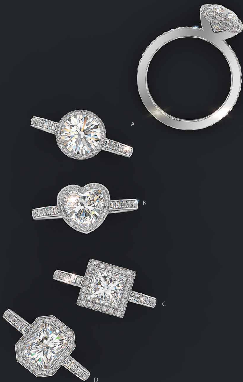
Equinox Blaze® ring for a (A) round, (B) heart shape, (C) princess, and (D) radiant center.