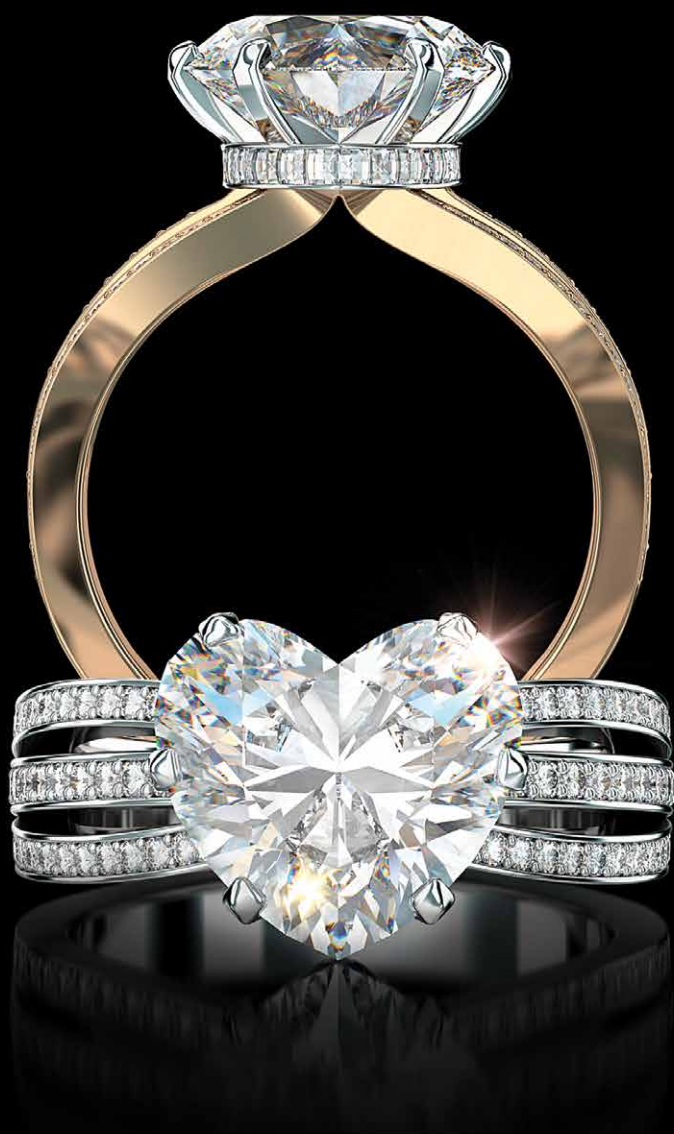
Belt of Fire