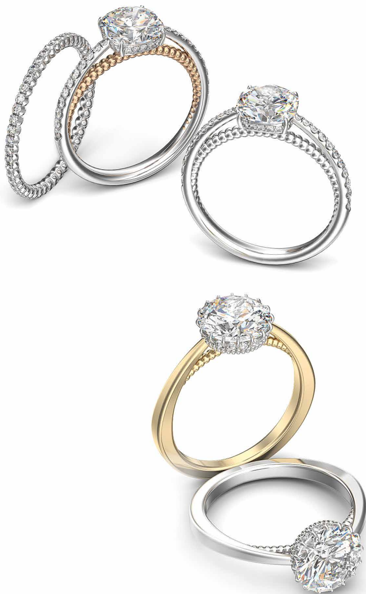
A new classic 12 prong setting created by Bez Ambar.