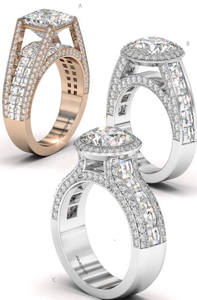
A. René ring for a princess center. B. Dome ring for a round center. C. Blaze® Tulip ring for a round center.