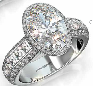
Ascent ring with Blaze® and round diamonds for (A) round, (B) heart shape, (C) an oval shape.